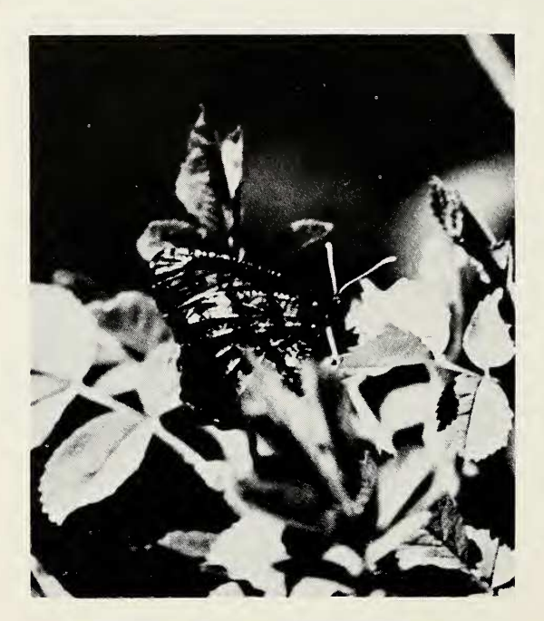
Fig. 1.—Habitat: Oeneis macounii Edws.